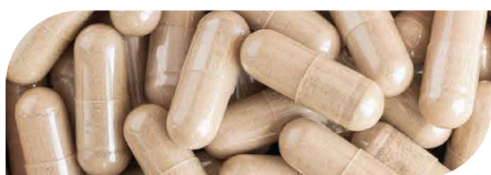
Vitamins and Minerals