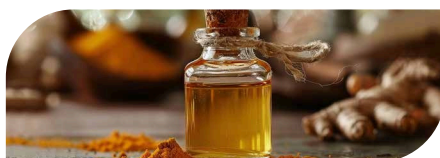
Antioxidants and Oils