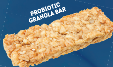
PROBIOTIC GRANOLA BAR