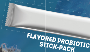
FLAVORED PROBIOTIC STICK-PACK